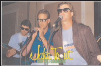
PGA Players: Sing Their Way to the Green Released: 1989

In the mid-80s, Peter formed the band Jake Trout and the Flounders along with Mark Lye and Payne Stewart.