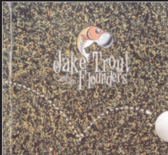
I Love To Play Released: 1989